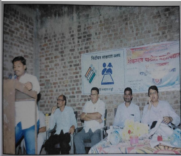
Students performing a programme for the Voter Awareness Day.