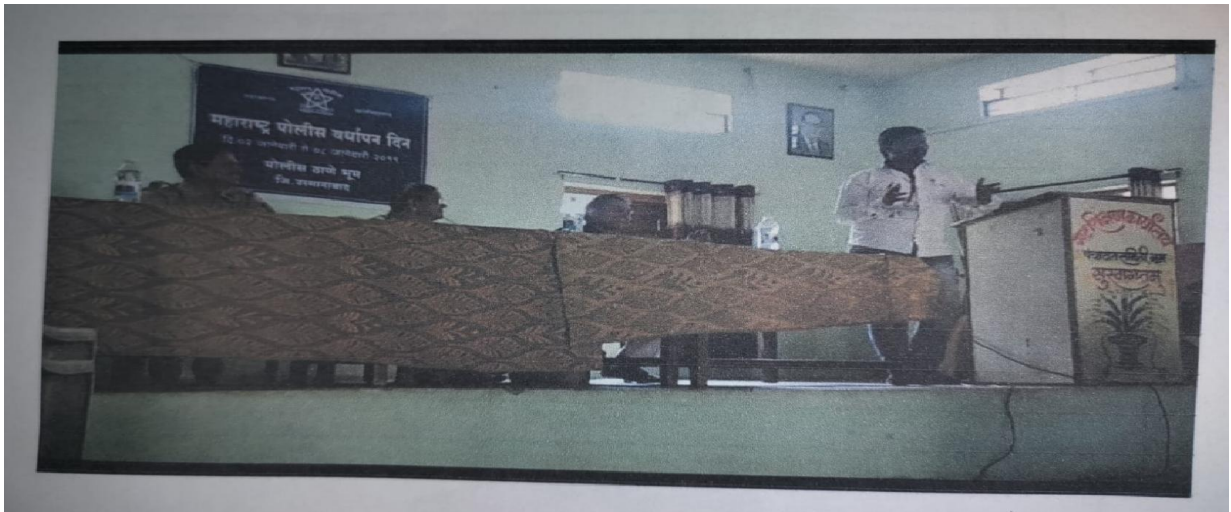
Students Participation in Oratory Competition organized on the occasion of Maharashtra Police Anniversary Day.