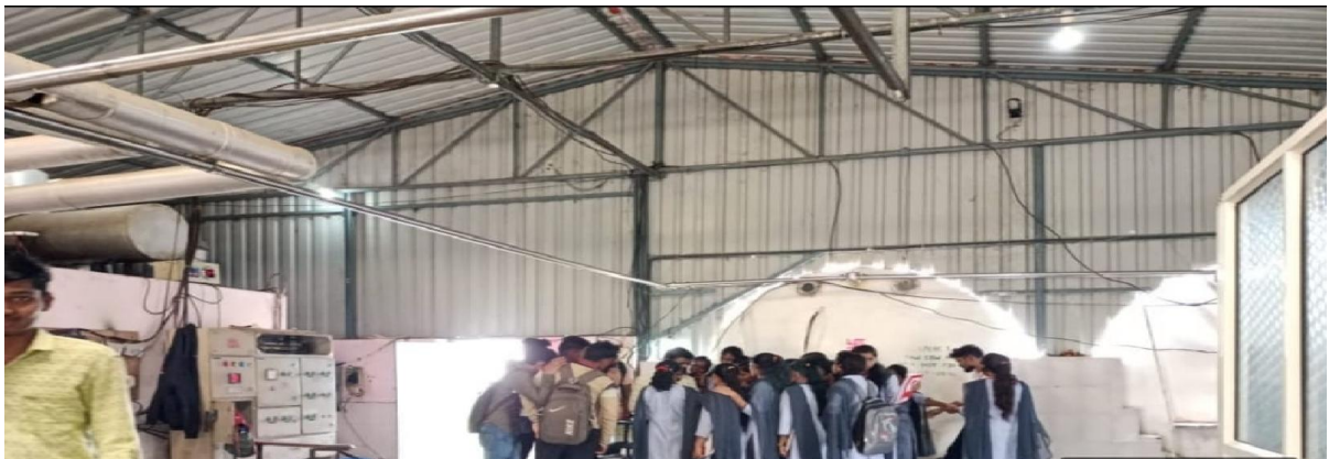
Students observing and understanding information about Agro industry.