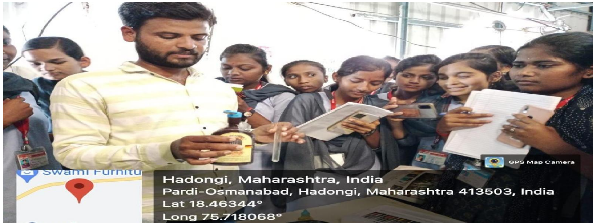
staff giving information and students observing and understanding information in details about milk products and milk chilling.